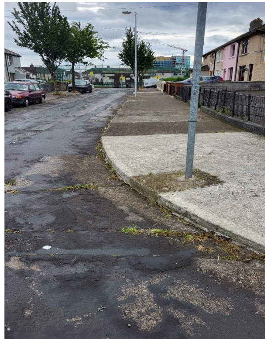
Russell Avenue, East Wall