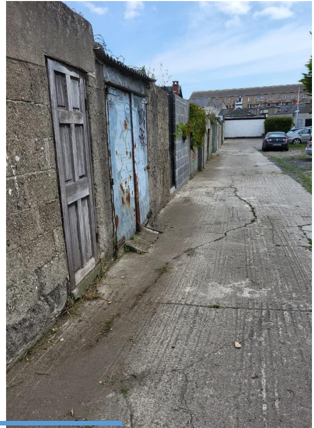
Trinity Terrace, Ballybough